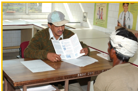
Counseling for HIV/AIDS

During the year 2004, 439 individuals were tested for HIV, of which 72 (16.4%) were tested positive. Pre test and post test counseling was provided to 300 and 250 individuals respectively.