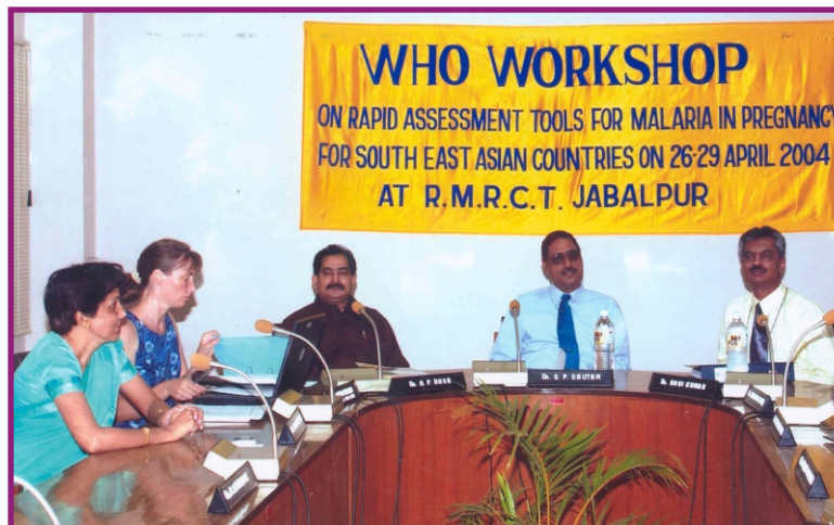
WHO workshop in process