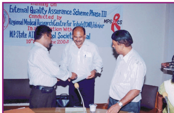
Valedictory session of EQAS workshop

A training program on External Quality Assurance Scheme for HIV testing was organized at RMRCT in association with the M.P. State AIDS Control Society, Bhopal on 10 th & 11 th June 2004. Fourteen medical officers and 20 laboratory technicians attended the training program. A hand on training was given to the participants as regards the HIV testing and its quality control.