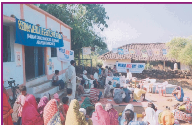
World AIDS day celebration

As a part of the World AIDS Week celebration, the RMRCT team visited nearby villages and educated the people about prevention of AIDS on 1 st December 2004 by showing films on AIDS, Group Discussions, Poster Exhibition etc.