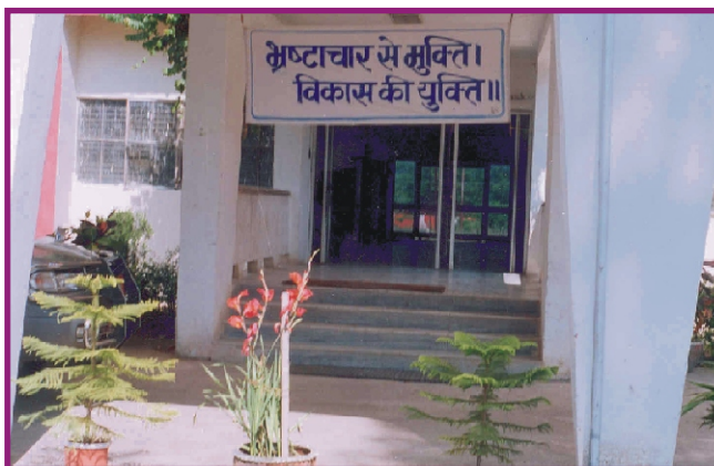
Observation of vigilance week

Vigilance week was observed at RMRCT from 1 st to 7 th November 2004. On this occasion, an oath was taken by the employees not to indulge in corrupt practices.